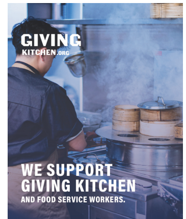
Example with your own image

We also included a transparent overlay so that you can use your own imagery.